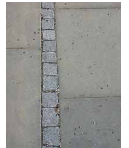
Reference Images - (left) Large format conc. unit pavers (300x500) with granite texture finish; (right) Stone cobble bands intermixed with paving flags.