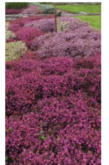
Reference Images - (left) Maple avenue tree planting, Ballincollig; (right) Mixed Heathers as low evergreen groundcover as winter pollinators, Co. Cork.